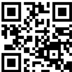
Junior Camp Video

Brimming with arts & crafts, sports, swimming and games, the program will also center on enrichment for a well-rounded approach. Each week there will be new learning goals and games catered to fit your child's learning and enjoyment needs.