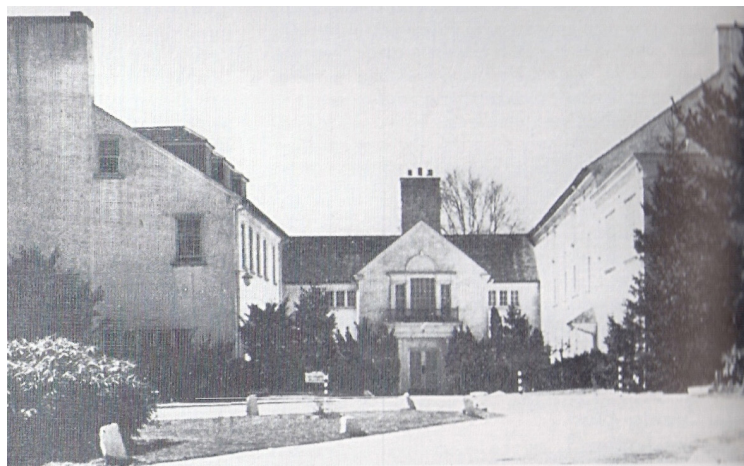
Cedarbrook clubhouse, mid-1940s

The Club's fortunes followed economic trends and with the help of the members, survived the precarious, prosperous 20s, the Great Depression of the 30s, and the wartime 40s. The Club played host to many local professional and amateur events through this period, highlighted by a match play competition between famed American golfing hero Gene Sarazen and reigning British Open Champion Arthur Havers in 1924; the 1925 Philadelphia Open won by Johnny Farrell; and the 1947 Philadelphia Inquirer Invitational, which saw South African Professional Bobby Locke outduel the legendary Ben Hogan during the 72-hole stroke play event. Even as the rich history of golf was being created at Cedarbrook, the property was considered so valuable that numerous attempts were made to purchase the property — by Temple University for the development of undergraduate schools and by developers to create a new baseball stadium for the Philadelphia Phillies.